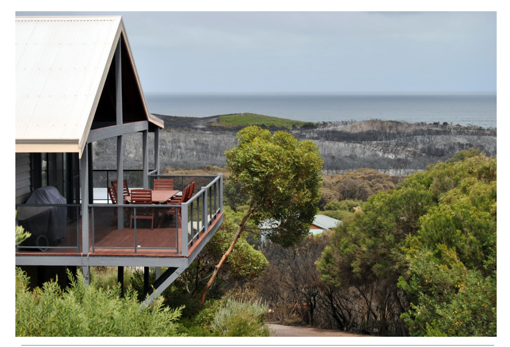
▲ Above: A MOUNTAIN WAVE CAUSED THE ESCAPE OF THE PRESCRIBED BURN NEAR MARGARET RIVER IN NOVEMBER 2011, EVEN THOUGH THE HILL THAT RESULTED IN THE DOWNSLOPE WINDS WAS ONLY AROUND 200M HIGH. 39 HOUSES WERE LOST.

These studies show the utility of highresolution numerical weather prediction in diagnosing the cause of unexpectedly severe bushfires, and this utility should translate into skill in the forecast situation. But high-resolution numerical weather prediction contains a wealth of finescale three-dimensional detail, only a small part of which will be relevant to a