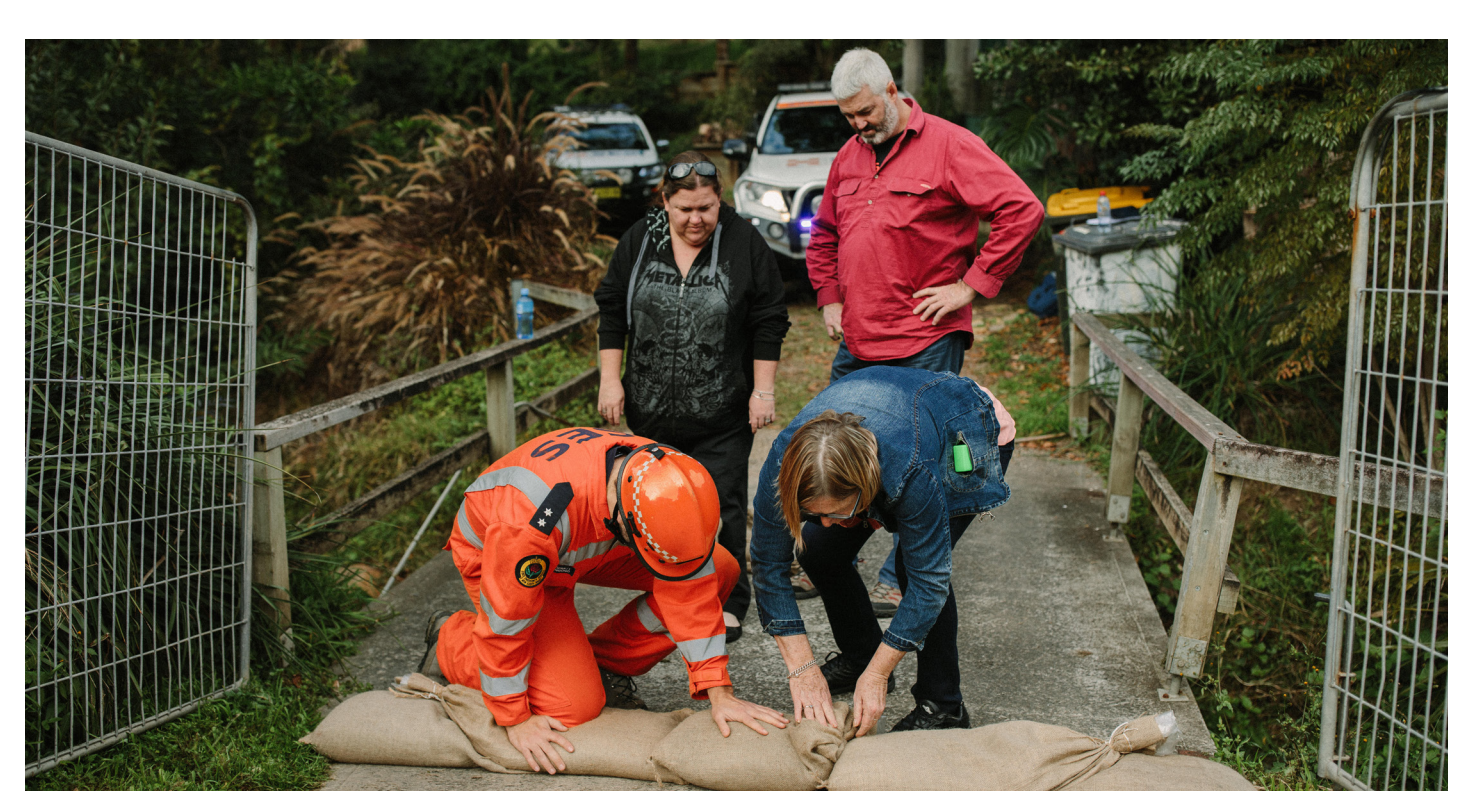
▲ Above: The study found that residents were more likely to prepare for bushfires or floods if they felt capable of doing so than if they merely had a positive attitude towards preparences