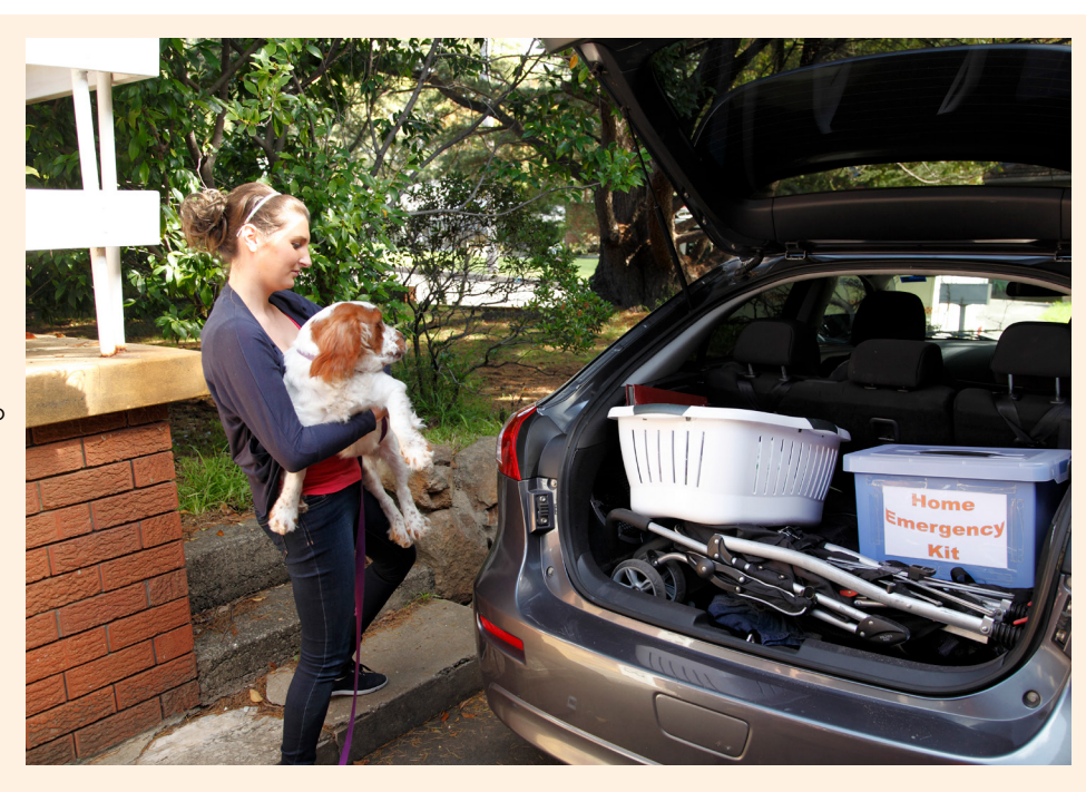
Above: This research found that residents who thought the ses held high expectations about community preparedness were more likely to have an emergency kit ready.

Data about bushfire and flood preparation from residents across several states was collected to measure the perceived attitudes